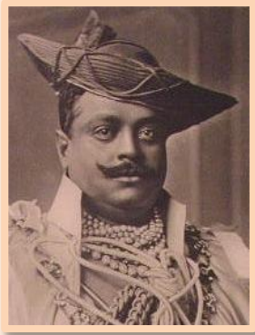
H.H. Kailashwasi Maharaja Jiwaji Rao Scindia.