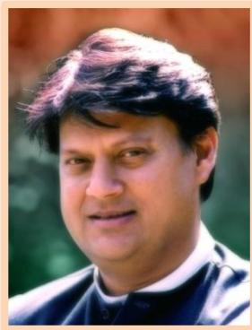
H.H. Kailashwasi Maharaja Madhav Rao Scindia