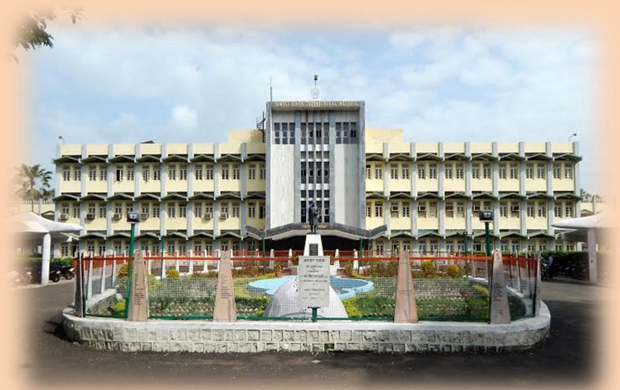
SAMRAT ASHOK TECHNOLOGICAL INSTITUTE (Engineering College) Vidisha (M.P.)