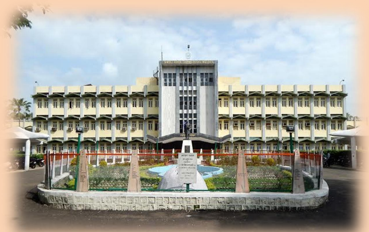
SAMRAT ASHOK TECHNOLOGICAL INSTITUTE (Engineering College) Vidisha (M.P.)