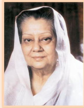
H.H. Kailashwasi Maharani Vijaya Raje Scindia