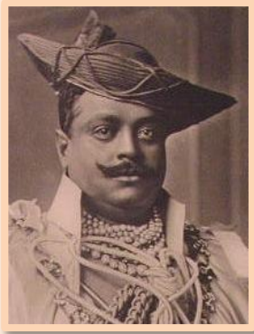
H.H. Kailashwasi Maharaja Jiwaji Rao Scindia.