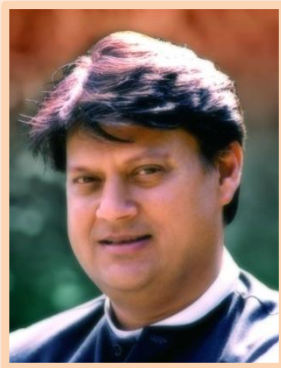
H.H. Kailashwasi Maharaja Madhav Rao Scindia